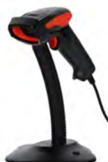
Scanner with Stand Demo