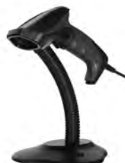
Scanner with Stand Demo