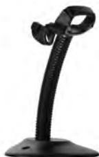
ST311 Optional Stand